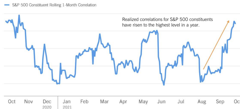
Data as of 10/15/2021.