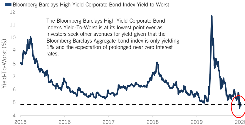
CHART OF THE WEEK High Yield Corporate Bond Yields At Record Lows