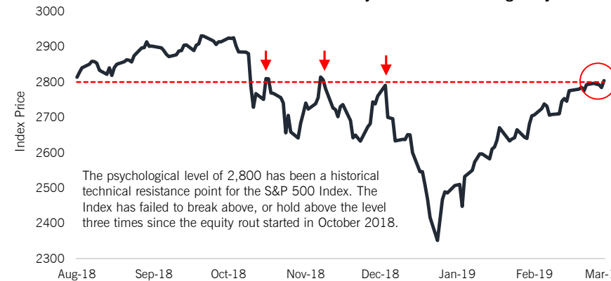
Fourth Time's The Charm? S&P 500 Faces First Major Resistance During Rally

Source: S&P 500 Index. Data as of 3/1/19.