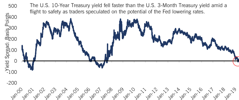
U.S. 10-Year Treasury Yield - U.S. 3-Month Treasury Yield