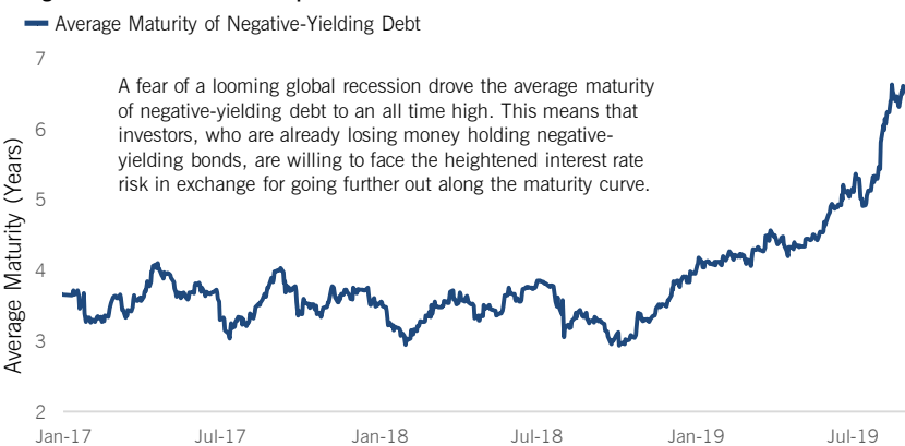
Data as of 9/06/19.